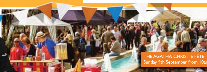
THE AGATHA CHRISTIE FÊTE Sunday 9th September from 10am