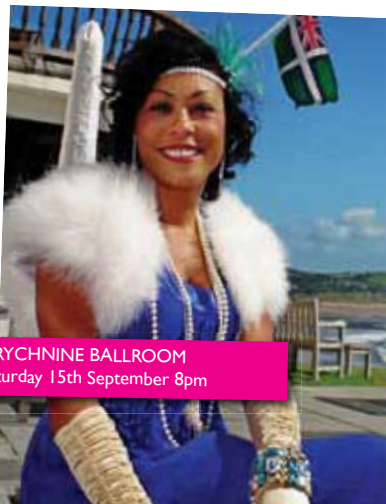
STRYCHNINE BALLROOM Saturday 15th September 8pm