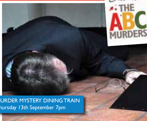
MURDER MYSTERY DINING TRAIN Thursday 13th September 7pm

Board the Dartmouth Express for an evening of murder and mystery with the Candlelight Theatre Company. Be on your guard at all times... A night not to be missed! Dartmouth Steam Railway, Queens Park Station, Torbay Road, Paignton TQ4 6AF - 01803 555872 Price: £52.50