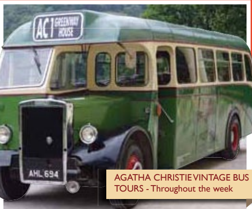
AGATHA CHRISTIE VINTAGE BUS TOURS - Throughout the week